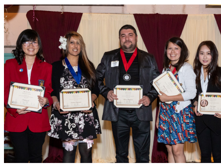
The award-winning college students.