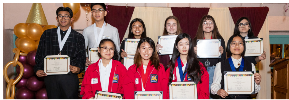
This year's high school winners proudly display their awards.

Every year, PIASC's R.A.I.S.E. Foundation provides grants to reward students who participate in its annual competitions. These grants assist with the expenses incurred in their participation in the Skills USA State and National Competitions, and/or help with their continued education. The R.A.I.S.E. Foundation also awards programming grants to area Graphic Arts programs.